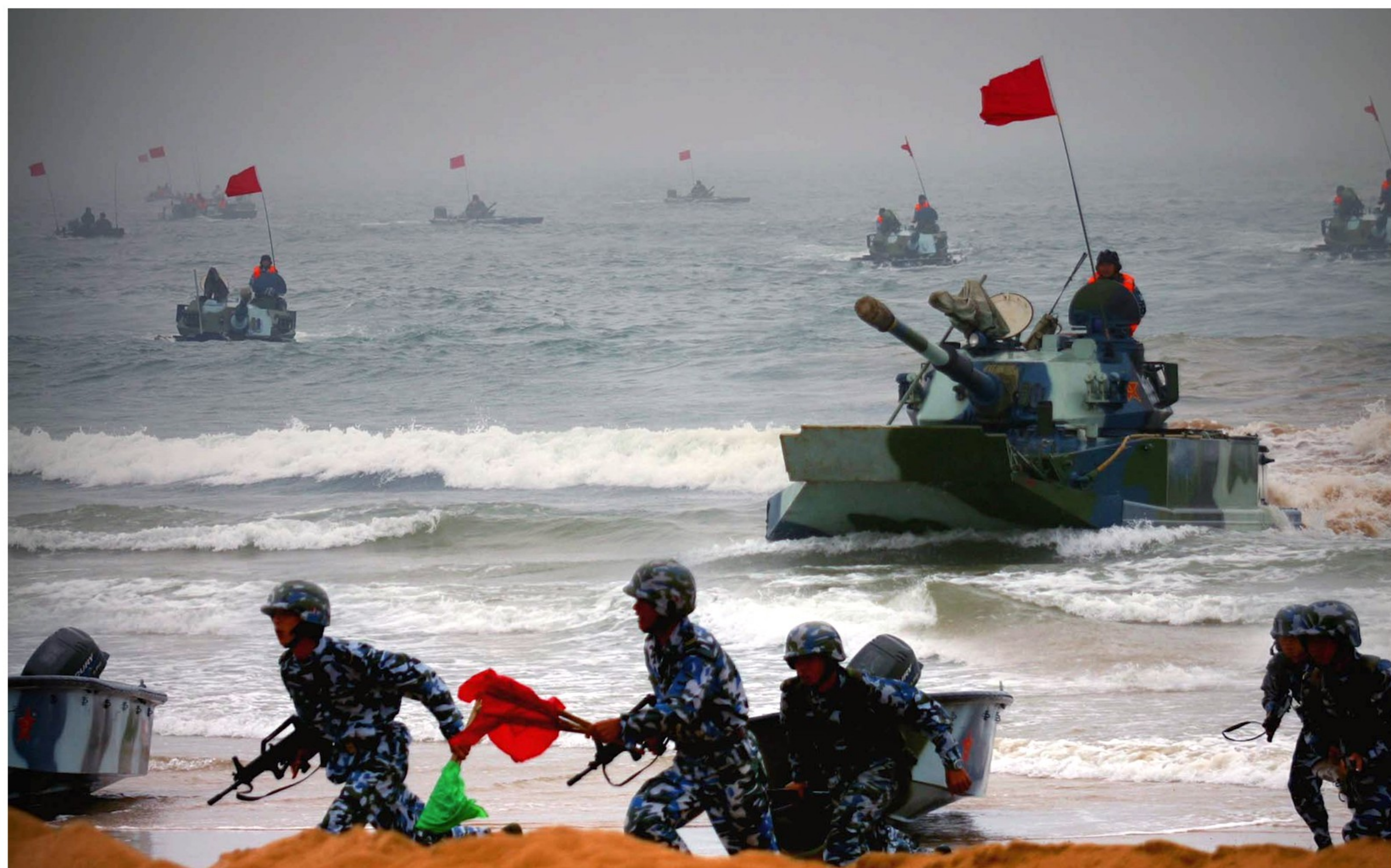
Chinese amphibious tanks and Marine Corps soldiers rush a beachhead in a landing drill held in Shandong province, 2005

In today's China, the "decision-making elite" more or less boils down to one man.