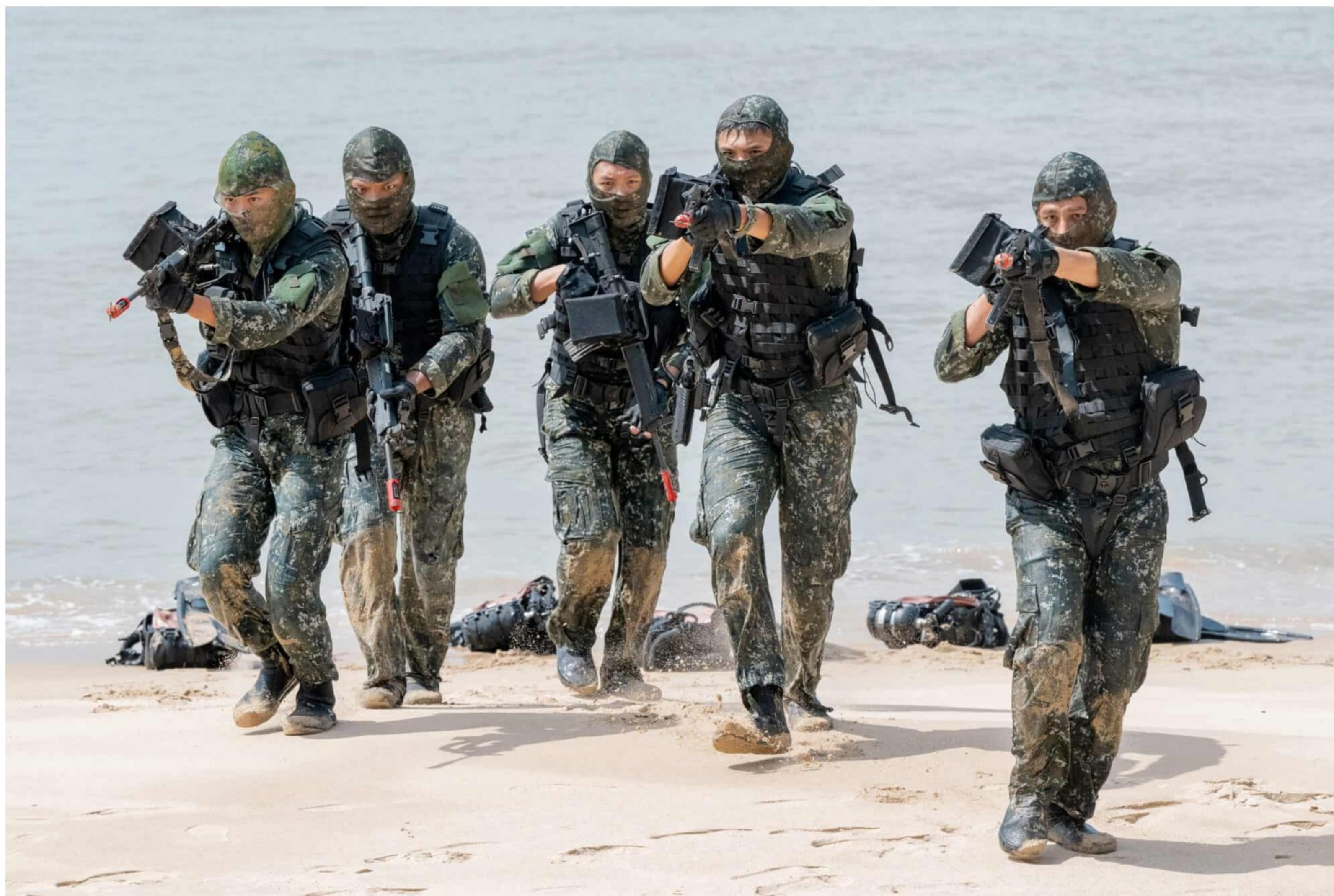
A Taiwanese amphibious reconnaissance battalion demonstrate on-shore penetration, October 2023

On October 19, 2023 — at a moment when Israel was fighting on multiple fronts, U.S. forces and Iranian proxies were exchanging fire in Syria and Iraq, Ukraine was approaching the two-year mark of its war for national survival, and North Korea was funneling arms and munitions into Putin’s war machine — President Biden summarized the stakes in a sobering Oval Office address.