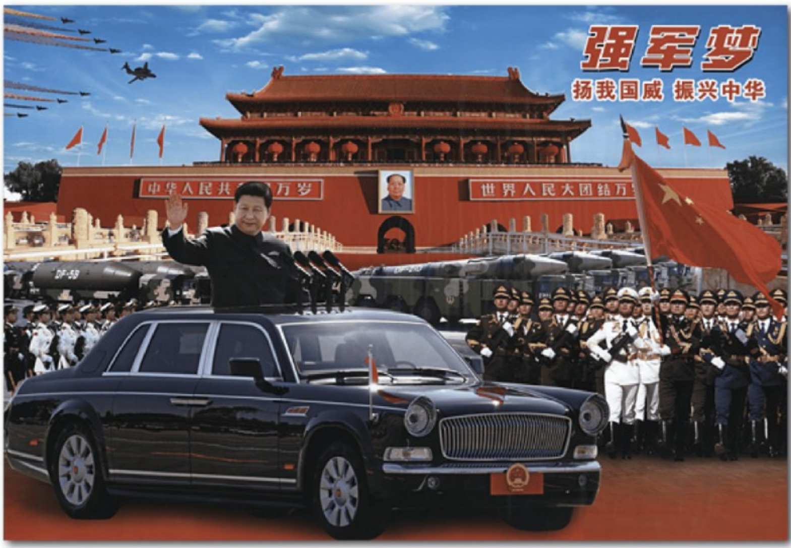
A Chinese military propaganda poster: "Dream of a strong army, make the strength of our nation known, rejuvenate China"

In other words, Xi appeared to elevate the goal of unification above the goal of peace. His tough signaling extended to China's official read-out of the meeting, which quoted Xi as follows: "The United States should embody its stance of not supporting 'Taiwan independence' in concrete actions, stop arming Taiwan, and support China's peaceful reunification. China will eventually be reunified and will inevitably be reunified."