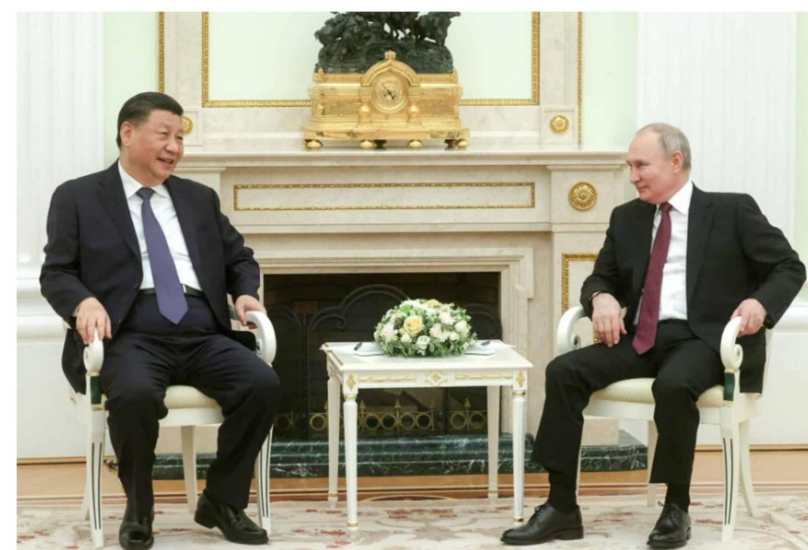
Xi Jinping and Vladimir Putin meet in Moscow, March 2023

Xi has since cast himself not just as a beneficiary of the current situation but as an architect. In March 2023, more than a year into Russia’s full-scale assault on Ukraine, Xi visited Moscow to strengthen his cooperation with Vladimir Putin. As he bade farewell to Putin at the Kremlin, Xi was captured on video telling his host: “Right now there are changes, the likes of which we haven’t seen for 100 years, and we are the ones driving these changes together.”