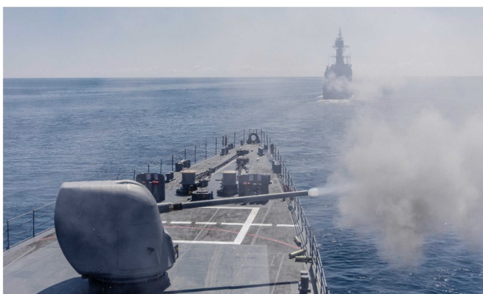
A live-fire exercise during Taiwan’s annual military drills, July 2022

As General Christopher G. Cavoli, America’s senior military officer in Europe, told me, one of the lessons of the Ukraine war is that “kinetic effects are what determine results . . . and the majority of kinetic effects are from legacy systems. So don’t ‘sunset’ legacy systems prematurely while awaiting the ‘sunrise’ of next-generation capabilities. Otherwise, we’ll be left stranded at midnight.”